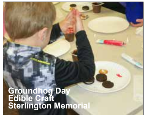
Groundhog Day Edible Craft Sterlington Memorial