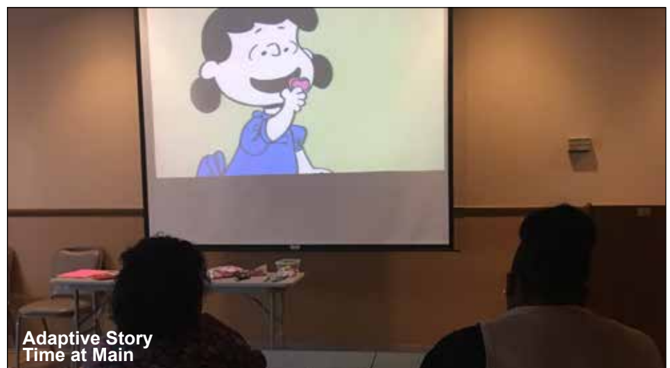
Adaptive Story Time at Main

Happy Easter! Your library will close at 5 pm on Thursday, March 29th, and remain closed March 30, 31, and April 1st for Easter.