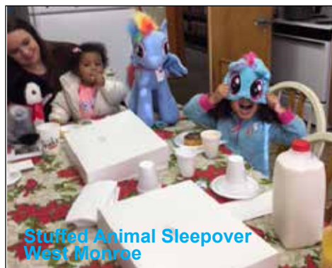
Stuffed Animal Sleepover West Monroe