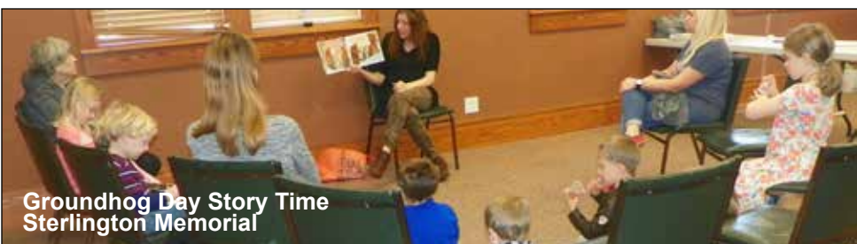
Groundhog Day Story Time Sterlington Memorial

Happy Easter! Your library will close at 5 pm on Thursday, March 29th, and remain closed March 30, 31, and April 1st for Easter.