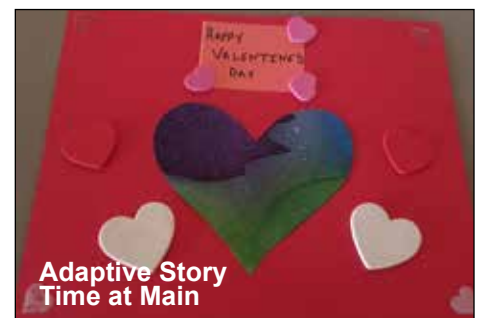
Adaptive Story Time at Main

Happy Easter! Your library will close at 5 pm on Thursday, March 29th, and remain closed March 30, 31, and April 1st for Easter.