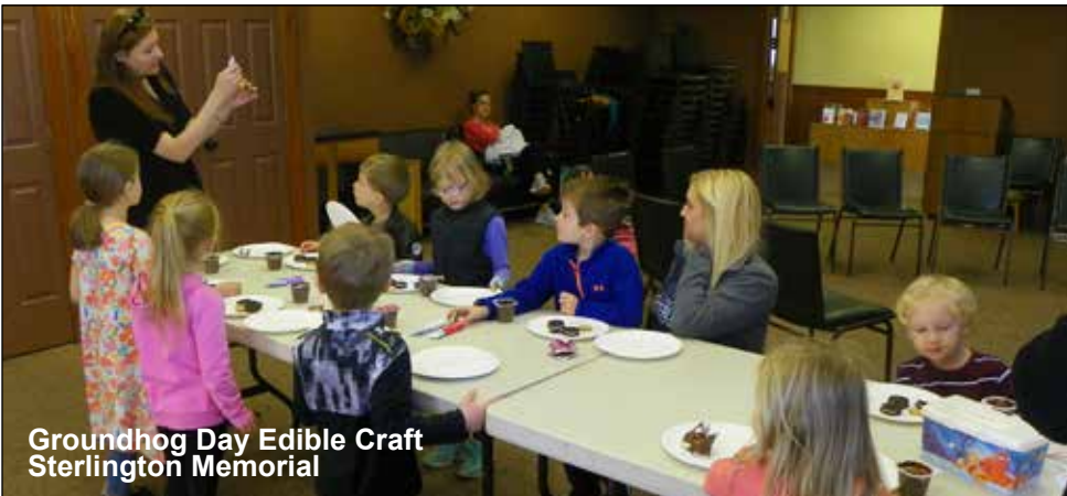
Groundhog Day Edible Craft Sterlington Memorial

Thursday, Mar. 29 at 2 pm Creature Comforts Pet Lovers' Book Club: Black Beauty , the 1877 classic by Anna Sewell.