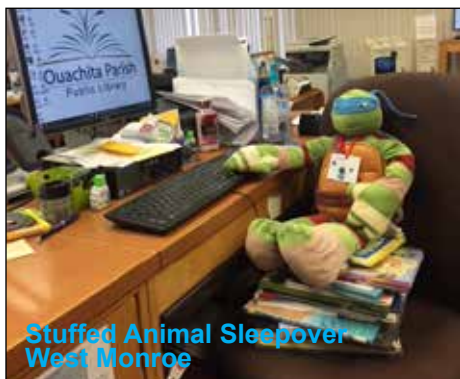
Stuffed Animal Sleepover West Monroe