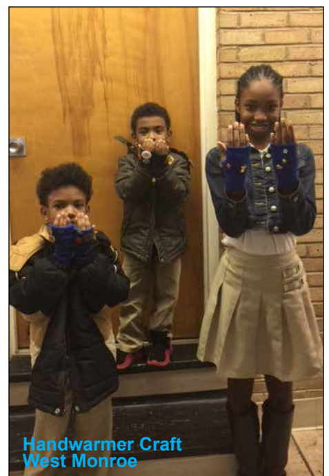
Handwarmer Craft West Monroe