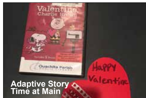
Adaptive Story Time at Main