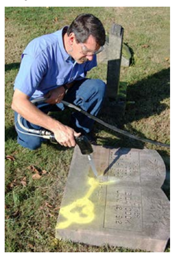
Figure 18. Graffiti is carefully removed using a low-pressure dry-ice misting instrument.

If the graffiti is water soluble, it can be removed using water and a soft cloth or towel. Rinsing the cloth frequently helps to avoid smearing graffiti on unaffected areas. If the graffiti is not water soluble, organic solvents or commercial graffiti removal products suitable for the grave marker material are recommended. Products should be tested prior to use. General cleaning of the entire marker is a good follow-up for a more even appearance. For deep-seated graffiti, poultice cleaning (previously described) may be required to extract staining materials.