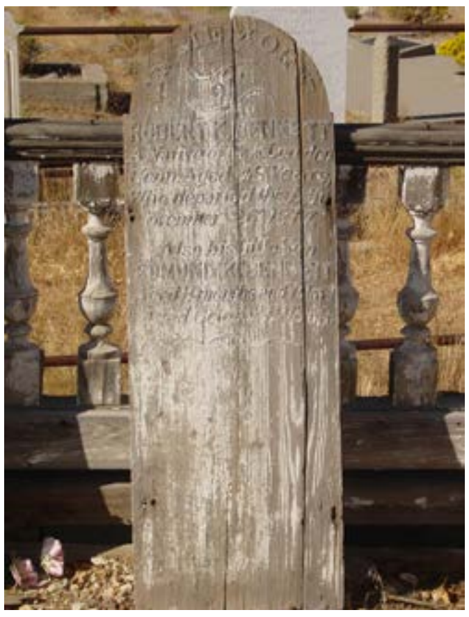
Figure 7. As shown by this 1877 marker in Silver Terrace Cemetery, Virginia City, NV, exposure to sunlight can damage wood grave markers, making the wood more susceptible to water damage and cracking.

and characteristics of these cells determine the wood's appearance and influence wood properties. Woodcell walls and cavities contain moisture. Oven drying reduces the moisture content of wood. After the drying process, the wood continues to expand and contract with changes in moisture content. The loss of water from cell walls causes wood to shrink, sometimes distorting its original shape (Fig. 7).