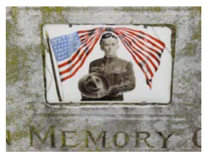
Figure 8. A fired ceramic, this cameo is set in a marble grave marker, located in Elmwood Cemetery, Memphis, TN. Different materials may require different conservation approaches.

Old cemeteries often include a wide variety of other materials not normally associated with contemporary grave markers, such as ceramics, stained glass, shells, and plastics (Fig. 8). As with masonry, metals, and wood, each has its own chemical and physical properties