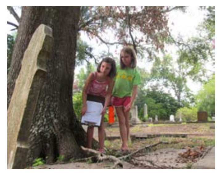
Figure 25. Involving the community in activities helps to develop an appreciation for the cemetery and serves to deter vandalism. Events may include children through school or scouting organizations and can help teach across the curriculum.

Maintenance is the key to extending the life of historic cemetery grave markers. From ensuring that markers are not damaged by mowing equipment and excessive lawn watering, to proper cleaning and resetting, good cemetery maintenance is the key to extending the life of grave markers. Whether rescuing a long-neglected small cemetery using volunteers or operating a large active cemetery with paid staff, the cemetery's documentation, maintenance and treatment plans should include periodic inspections. Only appropriate repair materials and techniques that do not damage historic markers should be used and records should be kept on specific repair materials used on individual grave markers. A well-maintained cemetery provides an attractive setting that can be appreciated by visitors, serves as a deterrent to vandalism, and provides a respectful place for the dead. A community history recorded in stone, wood and metal markers, cemeteries are an important part of our heritage, and are deserving of preservation efforts (Fig. 25).