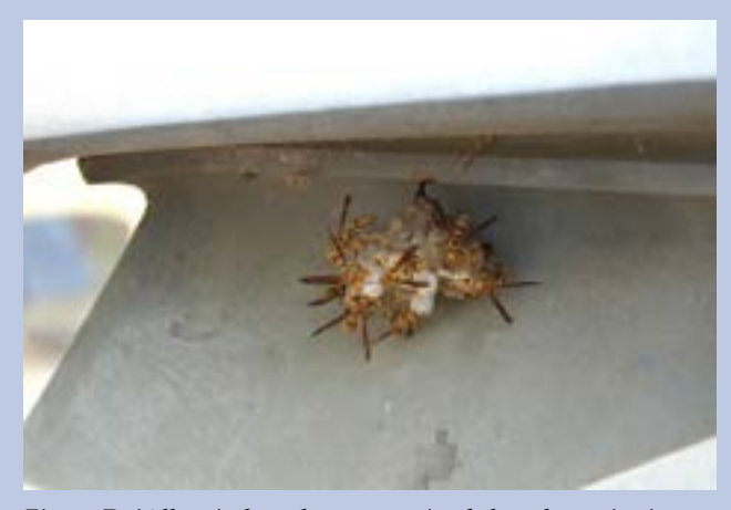
Figure D. Yellow jackets that are nesting below the projecting molding of this grave marker pose a hazard to visitors and staff because, if disturbed, they will vigorously defend their nest. Yellow jacket, paper wasp and hornet nests should be removed from grave markers by trained staff or specialists.

Snakes, wasps, and burrowing animals inhabit historic cemeteries (Fig. D). Snakes sun on warm stones and hide in holes and ledges, so it is important to be able to identify local venomous snakes. An appropriate venomous snake management plan should be in place, and