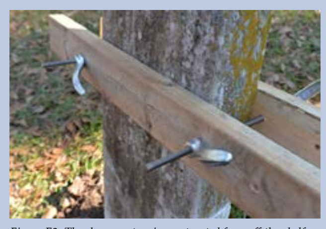
Figure E2. The clamp system is constructed from off-the-shelf wooden boards.

lifting techniques. Lift equipment and ergonomically correct tools should be routinely used to lift heavy markers (for most people this includes markers that weight more than 50 pounds). For smaller grave markers, a simple wooden clamp system can be constructed for a two-person lift (Figs. E1 and E2).