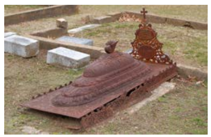
Figure 6. Decorative cast-iron grave markers like this late-19th century one in Oakland Cemetery in Shreveport, LA, are produced by heating the iron alloy and casting the liquid metal into a mold.

Metals are solid materials that are typically hard, malleable, fusible, ductile, and often shiny when new (Fig. 6). A metal alloy is a mixture or solid solution of two or more metals. Metals are easily worked and can be melted or fused, hammered into thin sheets, or