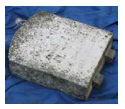
Figure 3. A multi-element grave marker from the early 19th century in the St. Michael's Cemetery, Pensacola, FL, consists of a vertical element with tabs (left image) into a slotted base (right image).

slot" grave marker, the tabbed upper stone was set in a slotted base (Fig. 3). More common today, the upper headstone is secured with a technique that uses small spacers set on the base and a setting compound. This technique or one that uses an epoxy adhesive may be found on older markers where the stones have been reset.