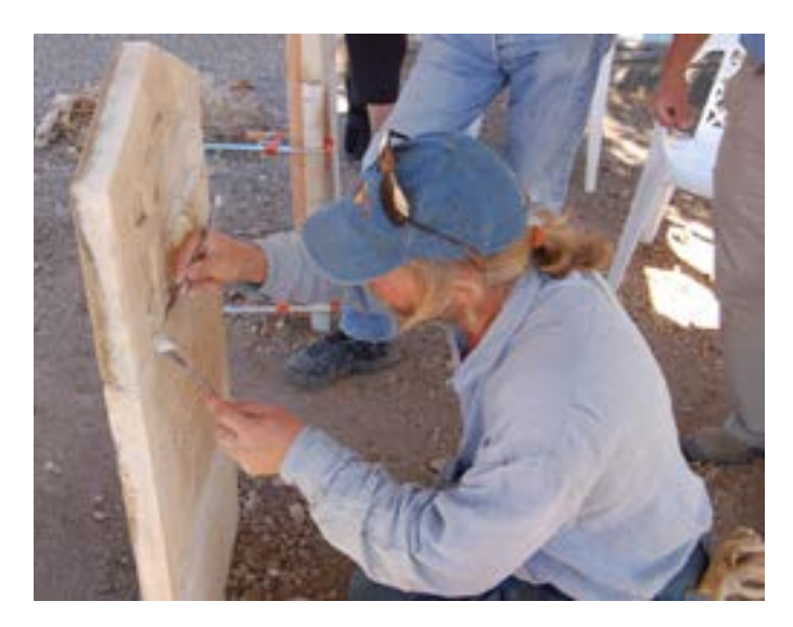
Figure 21. Cracks in a stone marker should be filled to keep water and debris out and prevent the crack from becoming larger. A patching mortar is designed to be used, in this case, with historic marble.

Hairline masonry cracks may be the result of natural weathering and require no immediate treatment except to be photographed and recorded. However, larger cracks often merit further attention. Repairing masonry cracks involves several steps and typically a skilled hand (Fig. 21). The repair begins with the removal of loose material and cleaning. Materials that are used for crack repair include grouts for small cracks and epoxy for large cracks affecting the structural integrity of the monument. Gravity or pressure injection is used to apply grout or epoxy. Crack repair can be messy, so careful planning and experience are helpful. If the crack is active, a change in size of the crack will be noted over time. Active cracks require further investigation to ascertain the cause of the changes, such as differential settlement, and to correct, if possible, the cause prior to repairing the crack.