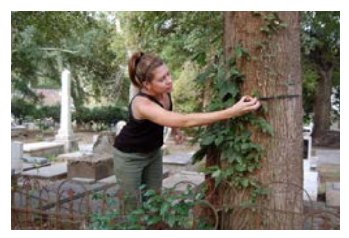
Figure 12. A cemetery professional undertakes a tree inventory in American Cemetery, Natchitoches, LA, to determine the health of trees in the cemetery. Management decisions for trimming or removal are based on the inventory.

Inappropriate maintenance activities can be devastating. One of the most common threats stems from improper lawn care, particularly the misuse of mowing equipment and string trimmers (weed whackers). The use of large mowers or mishandling them can lead to displacement of markers. Scrapes, gouges and even breakage also can occur. Improper use of string trimmers in areas immediately adjacent to grave markers can result in