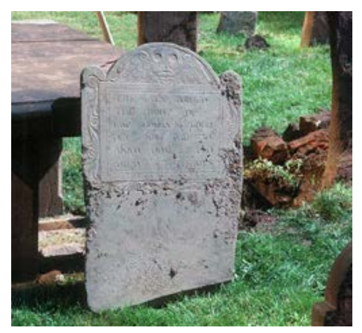
Figure 20a. This slate grave marker in the Ancient Burying Ground in Hartford, CT, is a ground-support stone. Resetting requires digging a hole that will hold the base of the stone and then compacting the soil at the bottom of the hole by hand.

Inexperienced staff or volunteers should not attempt resetting without training from a conservator, engineer, or other preservation professional. When dealing with fragile or significant grave markers, or those with large