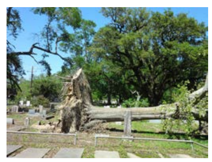
Figure 11. Woody vegetation can damage grave markers and pose a risk to visitors unless well managed and maintained.

Aside from vandalism and purposeful neglect, most risk factors attributable to human activity are unintentional. Sometimes damage to grave markers is the result of cleaning or repair done with the best of intentions. These unfortunate mistakes can be the result of insufficient training and funding, misuse of tools and equipment, and poor planning. With proper training and supervision, human risk factors can be lessened.