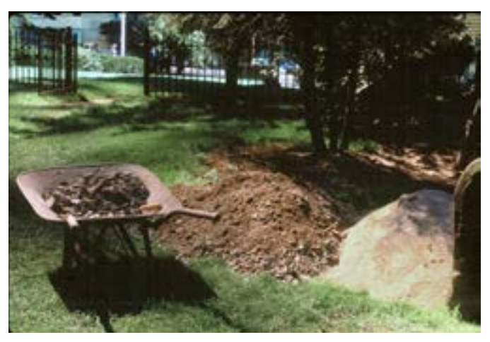
Figure 20b. To facilitate drainage, crushed stone, gravel, and sharp sand line the hole and are hand-tamped around the stone after placement.