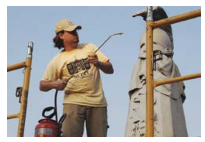
Figure 24. A severely deteriorating monument or grave marker can be treated with a stone consolidant. The treatment is usually applied using a spray system. The consolidant soaks into the stone and replaces mineral binders that hold the stone together. On-site and laboratory testing and evaluation are performed prior to using this non-reversible type of treatment.

When erosion is severe, consolidation treatments (e.g., ethyl silicate) have been used to replace mineral binders lost to weathering (Fig. 24). Because these treatments are not reversible, laboratory and on-site testing are essential. Application by a conservator or other experienced preservation professional is advised.