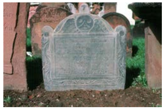
Figure 20c. The reset ground-supported grave marker should be level and plumb.