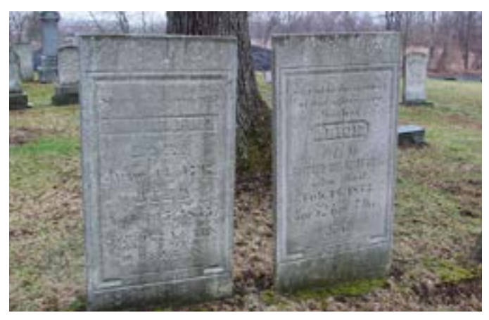
Figure 2. These mid-19th century, single-element stone grave markers in the Grove Cemetery in Bath, NY, are set in a vertical position.

slot" grave marker, the tabbed upper stone was set in a slotted base (Fig. 3). More common today, the upper headstone is secured with a technique that uses small spacers set on the base and a setting compound. This technique or one that uses an epoxy adhesive may be found on older markers where the stones have been reset.