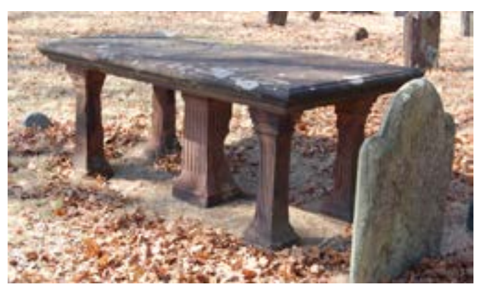
Figure 4. This sandstone table tomb, located in Cedar Grove Cemetery, New London, CT, is an engineered grave marker structure consisting of a horizontal stone tablet supported by four vertical table "legs" with and a central column, Photo: Jason Church.

Grave markers can also be engineered structures. Examples of grave marker structures include masonry arches, box tombs, table tombs, grave shelters, and mausoleums (Fig. 4). The box tomb is a rectangular structure built over the gravesite. The human remains are not located in the box itself as some believe, but