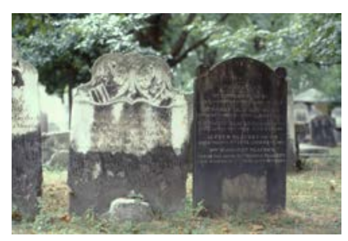
Figure 9. The limestone and sandstone grave markers in this historic cemetery have different weathering processes. On the left, the limestone shows surface loss in areas exposed to rainwater and gypsum crust formation below. The sandstone marker on the right displays uniform soiling, but surface hardening may be occurring.

All grave marker materials deteriorate when they are exposed to weathering such as sunlight, wind, rain, high and low temperatures, and atmospheric pollutants (Fig. 9). If a marker is composed of several materials, each may have a different weathering rate. Some weathering processes occur very quickly, and others gradually affect the condition of materials. Weathering results in deterioration in a variety of ways. For example, when exposed to rainwater some stones lose surface material while others form harder outer crusts that may detach from the surface.