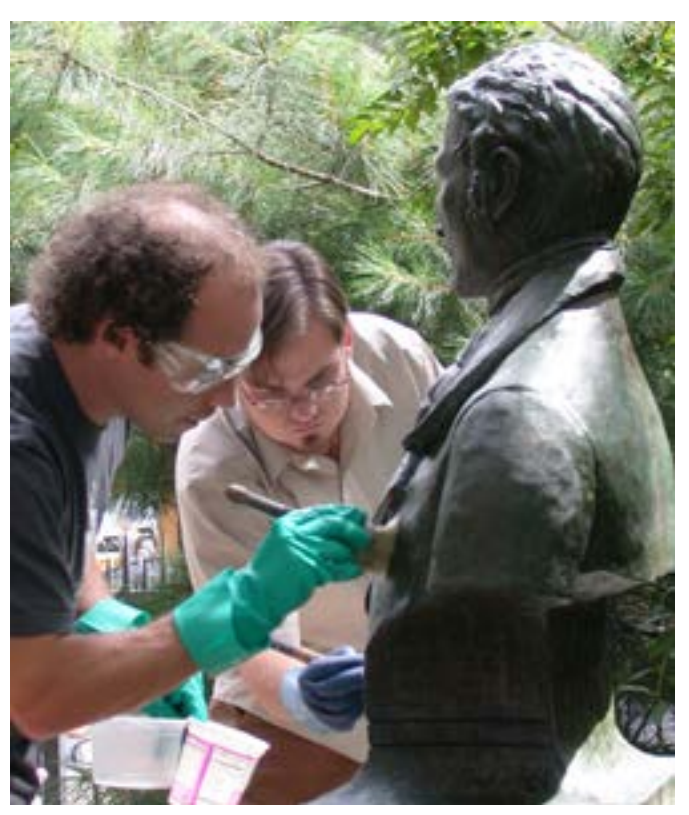
Figure 22. A protective coating must be maintained on metal elements. Wax or lacquer coatings help preserve the bronze patina and slow corrosion. Conservators apply a microcrystalline wax to this bust at St. Mark's Church in-the-Bowery, New York, NY.

Wax coatings are often used for bronze markers (Fig. 22). Wax provides a protective barrier against moisture, soiling, and graffiti. There are several steps in the wax application process. Where there is little corrosion, gentle cleaning of the marker is undertaken prior to applying the wax coating. Apply a thin layer of wax to the marker using a stencil brush or chip brush.