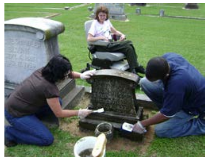
Figure 17. Volunteers can undertake cleaning of grave markers once they have received initial training. Cleaning methods may include wetting the stone, using a mild chemical cleaner, gently agitating the surface with a soft bristle brush, and thoroughly rinsing the marker with clean water.

General maintenance may involve low-pressure water washing. In most cases, surface soiling can be removed with a garden hose using municipal water or domestic