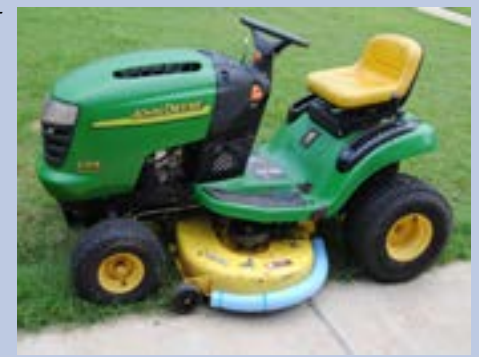
Figure B. A pool 'noodle' can be fitted to the deck of a lawnmower to prevent damage to grave markers.

maintenance activity in historic cemeteries.