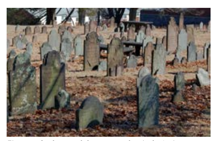
Figure 1. Sandstone and slate grave markers in the Ancient Burying Ground in New London, CT, display a variety of weathering conditions. Markers in the cemetery date from the mid-17th to the early 19th centuries.

This Preservation Brief focuses on a single aspect of historic cemetery preservation—providing guidance for owners, property managers, administrators, inhouse maintenance staff, volunteers, and others who