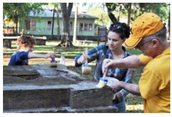
Figure 23. Limewash is a breathable coating sometimes used to protect the surface of the grave marker and provide a decorative finish. Limewash is applied by brush in five to eight thin coats (with each coat about the consistency of skim milk). The surface is allowed to slowly dry between coats. Sometimes the surface is covered by damp burlap to slow the drying process.

Limewash is a traditional coating that brightens stucco-covered grave markers (Fig. 23). Like paint coatings, it needs to be periodically applied. Limewash is prepared with lime putty or hydrated lime and water. Curing begins following application. The lime putty or hydrated lime reacts with carbon dioxide in the air in a process called carbonation. This reaction eventually forms calcium carbonate, a stable hard coating. Limewash is a "green" coating with no volatile organic compound content and is "breathable," i.e., it allows for water vapor transmission. Although commonly white, limewash can be colored or tinted with alkali-stable pigments such as iron oxide.