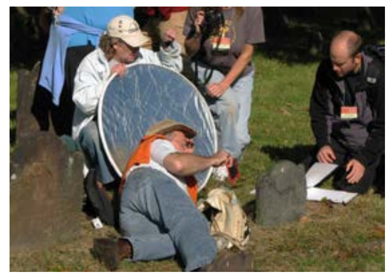
Figure 15b. Photographs are used to document the condition of the grave marker as part of a condition assessment.

A tool kit for the condition assessment may include binoculars, digital camera, magnifying glass, measuring tape, clipboard, carpenter's rule, level, magnet, and flashlight. For large monuments, a ladder or aerial lift may be required. Photographs of each marker, including overall shots and close-up details, are an essential part of the documentation process. Photo logs are helpful for