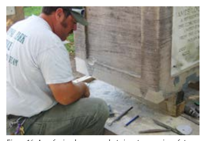
Figure 16. A professional mason works to insert a new piece of stone. Often referred to as a "dutchman", this repair technique requires replacing the deteriorated stone section with a new finished piece of the same size and material.

The cemetery manager can use the information from the condition assessment report to develop a maintenance plan with a list of cyclical maintenance work. Many tasks can be carried out by in-house staff. For example, maintenance cleaning of metal and stonework can often be accomplished by rinsing with a garden hose. Applications of wax coatings can be used to protect bronze elements. Trained staff can undertake these tasks. Teaching graffiti removal techniques to cemetery staff may also be necessary if vandalism is an on-going problem. Staff should have access to written procedures