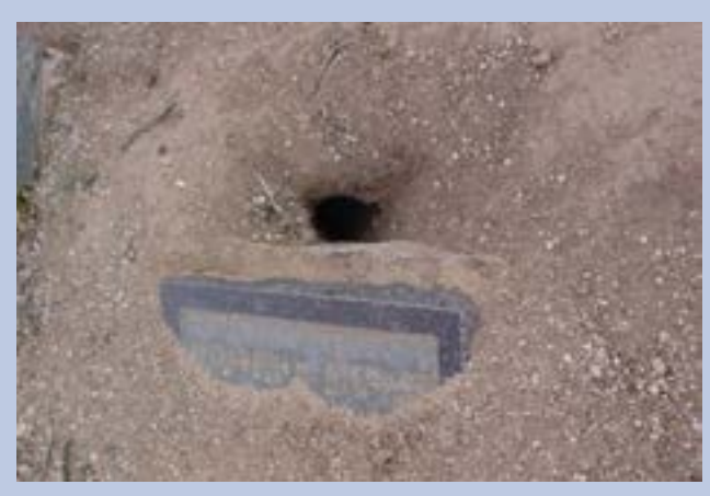
Figure C. Gophers and other burrowing animals produce uneven ground and holes that are trip and falling hazards to visitors and staff of historic cemeteries.

Trip and falling hazards include uneven ground, holes, open graves, toppled grave markers, fallen tree limbs, and other debris (Fig. C). Sitting, climbing, or standing on a grave marker should be avoided since the additional weight may cause