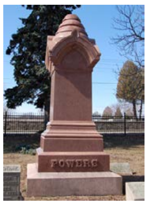
Figure 5. A variety of colors of natural stone are found in historic cemeteries, such as this pink granite marker in the Cedar Grove Cemetery, New London, CT.

physical structure of the stone influence weathering and the selection of materials and procedures for its cleaning and protection.