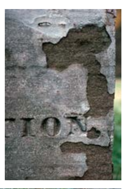
Figure 14. Highpressure water washing can damage grave markers. The photograph shows "wand marks" on the headstones produced by inappropriate pressure washing.