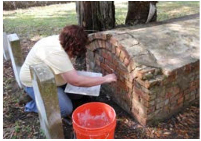
Figure 19. Masonry markers like this box tomb may require the repointing of mortar joints. It is important to use a mortar that is softer than the historic brick. In this case a conservator uses a lime putty-based mortar to repoint.

requires repointing? What mortar mix is suitable for the historic masonry? How quickly will mortar need to cure? Soft mortars contain traditional lime putty or modern hydrated lime. Harder mortars contain natural or Portland cement. If necessary, mortars can be tinted with alkali-stable pigments to match historic mortar colors. The selection of the mortar to be used is critically important to the success of the project. An inappropriate mortar can result in unattractive work and accelerate the deterioration of the historic grave marker. Always avoid the use of bathtub caulk and silicone sealants for repointing mortar joints.